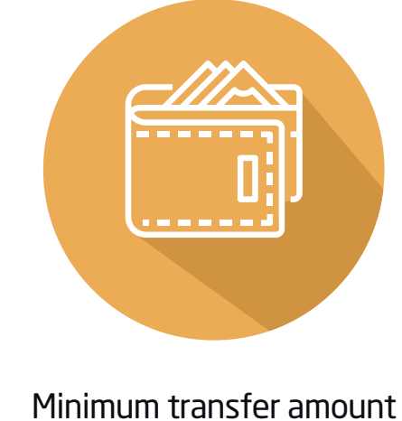
of AED 1,500 or equivalent in foreign currency